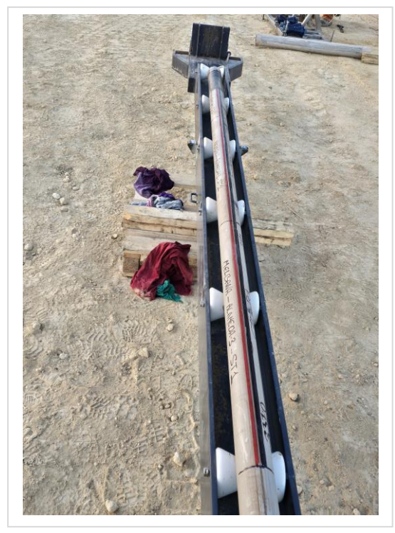
Marti reservoir core sample