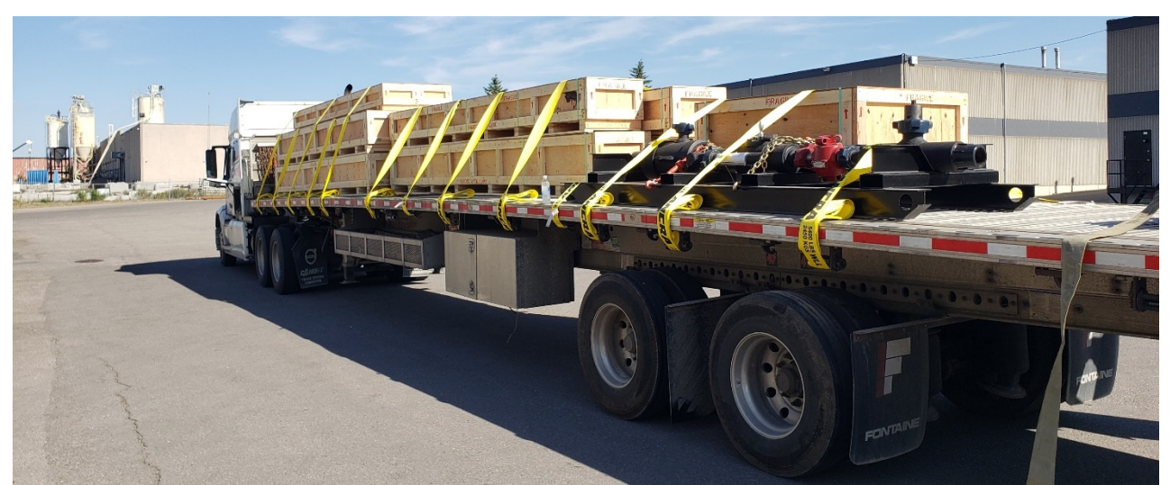
Figure 1 – Liner hangers packed for transport from manufacturer's yard

Melbana's inspection of the drilling rig has been completed and found all equipment to generally be in a satisfactory condition. Melbana is working with the contractor to address several matters identified by the inspection, but these are not expected to impact the commencement of drilling operations on the forecast date in September.