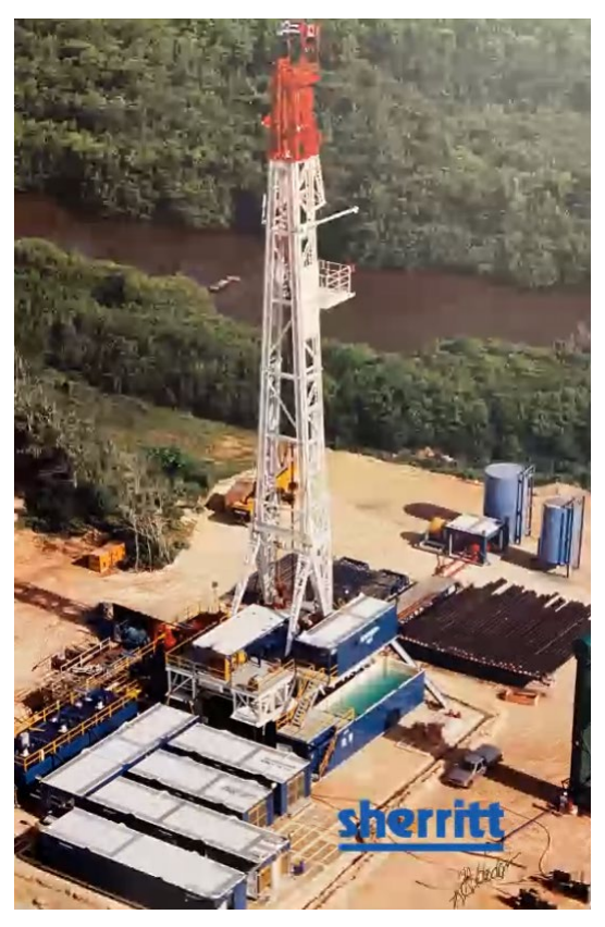
Figure 4 – Sherritt's Rig No. 1 will be used for Melbana's forthcoming Block 9 drilling program (shown here at a previous drilling operation)

Civil works related to the second exploration well, Zapato-1, have also commenced.