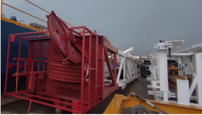
Figure 3 - Mast of rig to be used in upcoming drilling operations

In August Melbana completed a two-day virtual workshop to test and discuss readiness and planning for the commencement of drilling operations. The workshop was attended by over 60 people, comprised of representatives of Melbana's contractors, suppliers, partners and regulators.