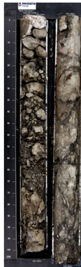
Figure 2 – Oil filled and heavily fractured limestone from Unit 1B