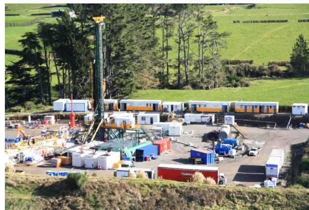
Figure 2 - The Nova-1 Drilling Rig contracted to drill the Pukatea-1 wildcat exploration well