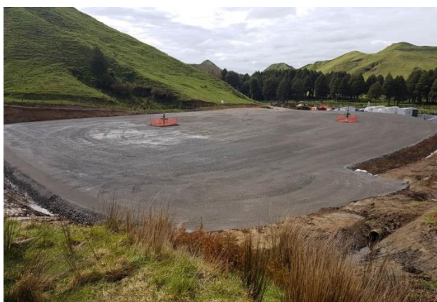
Figure 1 - Completed Pukatea drilling pad with existing Puka-1 and Puka-2 suspended wells protection zones visible