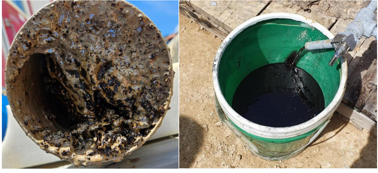
Figure 1 - Core showing the presence of black oil in naturally fractured limestone

Testing operations for this first and shallowest unit are now complete and results are being evaluated. Preparation is underway to re-commence drilling the 8\frac{1}{2} " hole to the next core point in Unit 1B at 929 mMD.