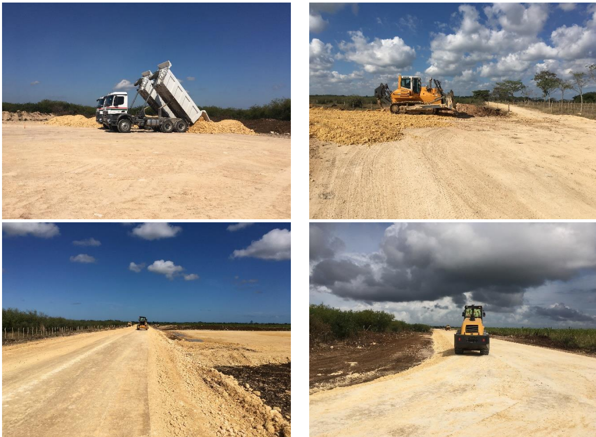
Figure 1 – Construction of access roads and well pad for Alameda-1 is now more than 50% complete