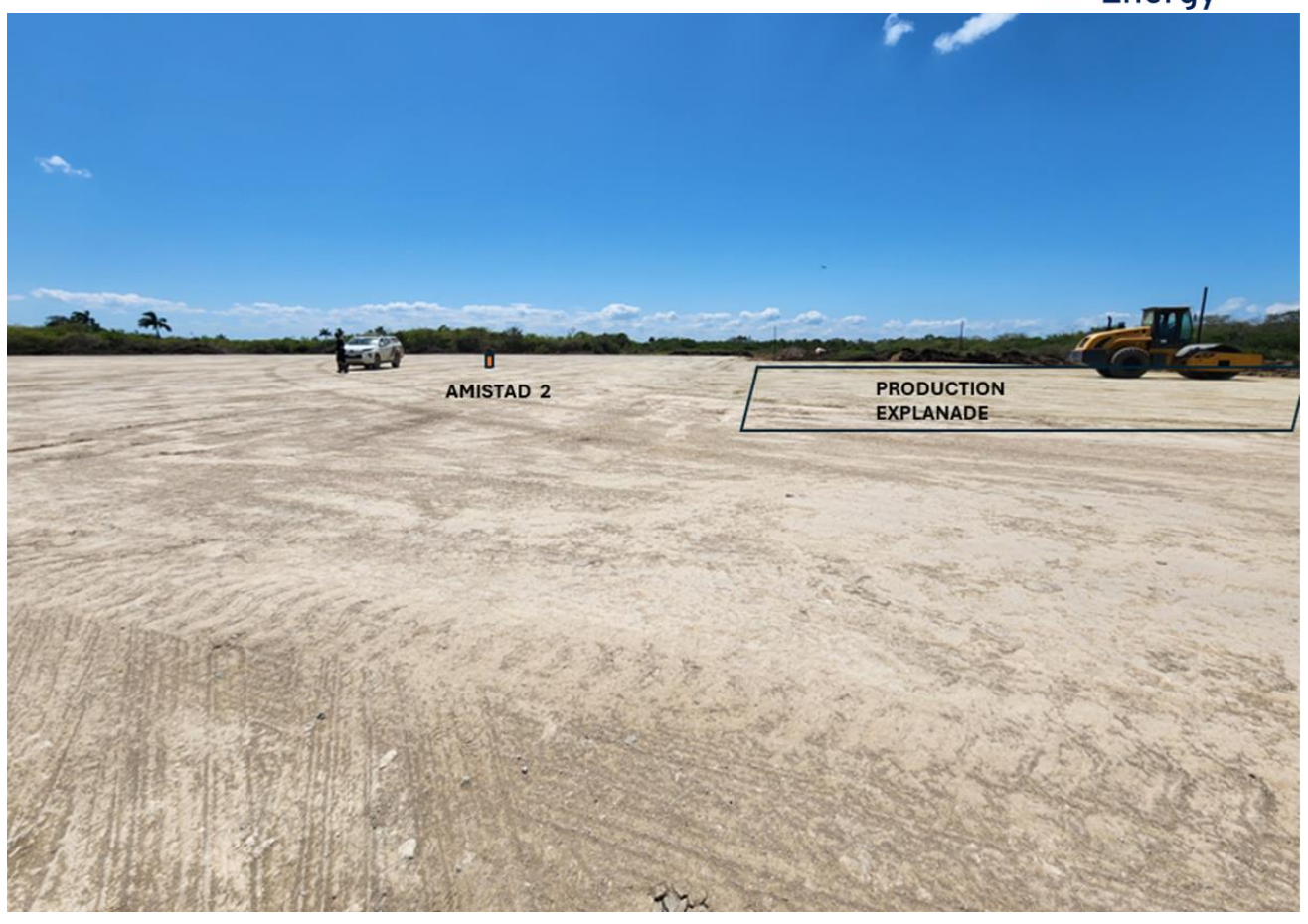
Figure 3 – Amistad-2 well pad (Pad-9).

Amistad-2 is scheduled to spud in the June quarter.