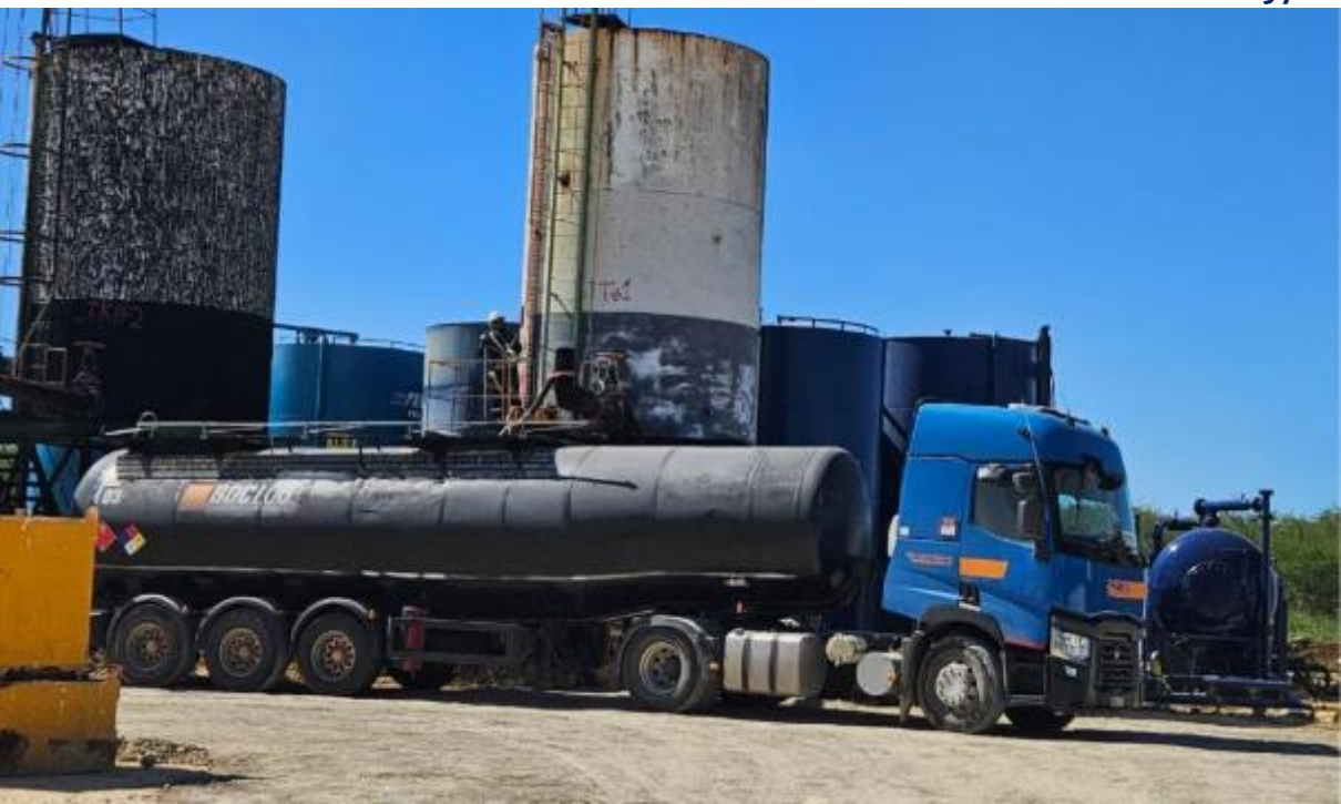
Figure 2 – Loading of Unit 1B crude oil to tanker at the Alameda-2 wellsite.