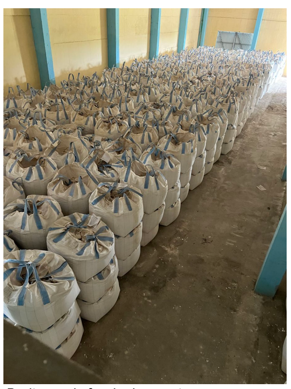
Barite ready for deployment.